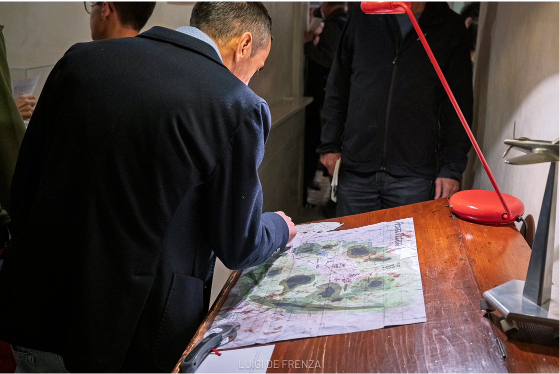
A visitor and the Ahvani map