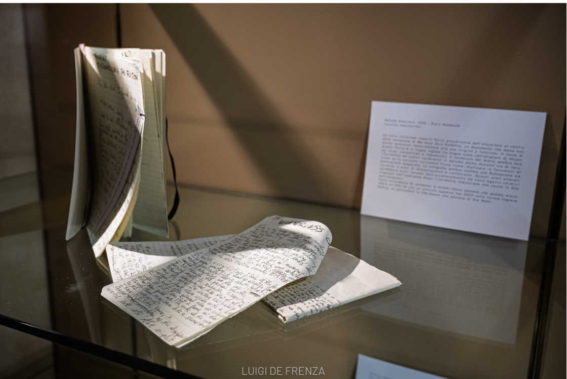
LUIGI DE FRENZA