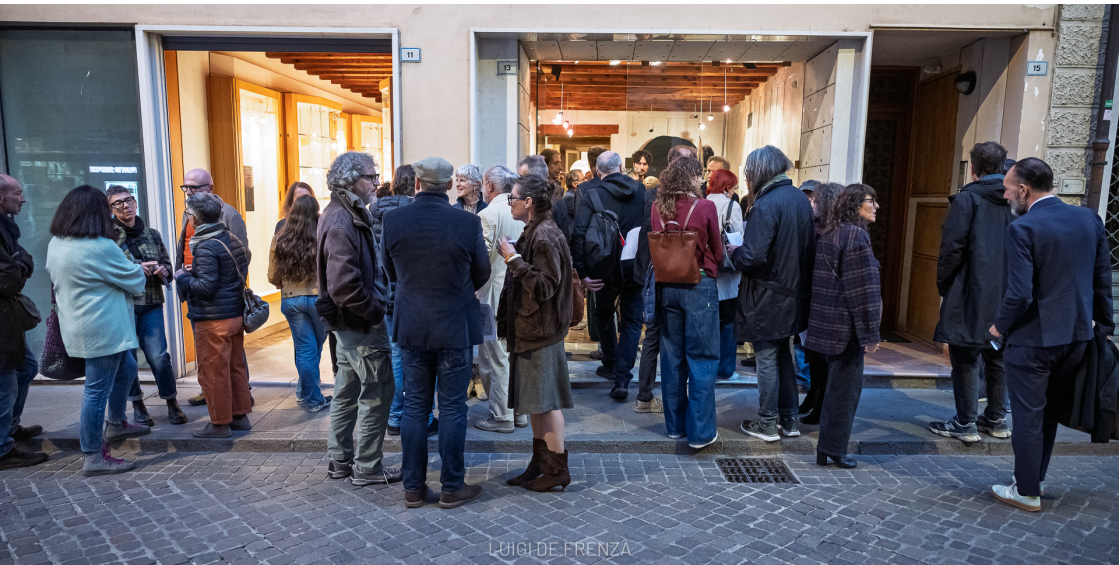
People outside the gallery